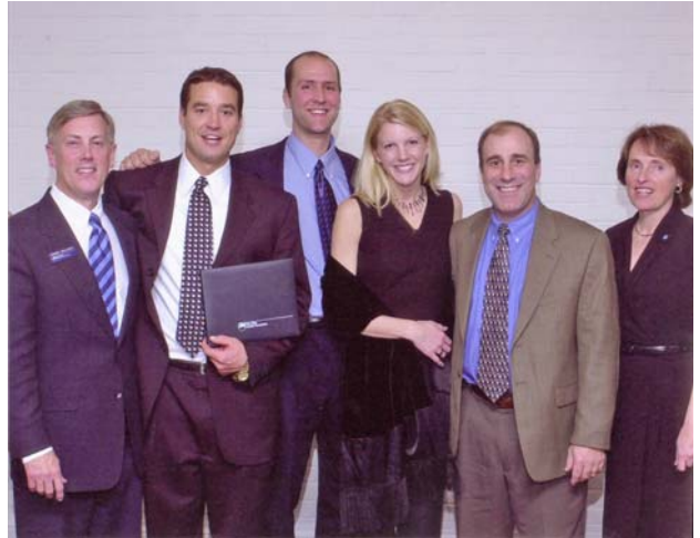
Members of the DMAIG proudly accept the Alumni Achievement Award from the Penn State Alumni Association.

WOW is also how I would describe the involvement of all the Dance Marathon Alumni Interest Group (DMAIG) members. Through your involvement, the DMAIG recently received the 2003 Alumni Interest Group Achievement Award from the Penn State Alumni Association for commitment that the group has demonstrated toward THON!! Over the past 8 years, since its inception in 1996, the DMAIG has continued to promote, support and perpetuate the